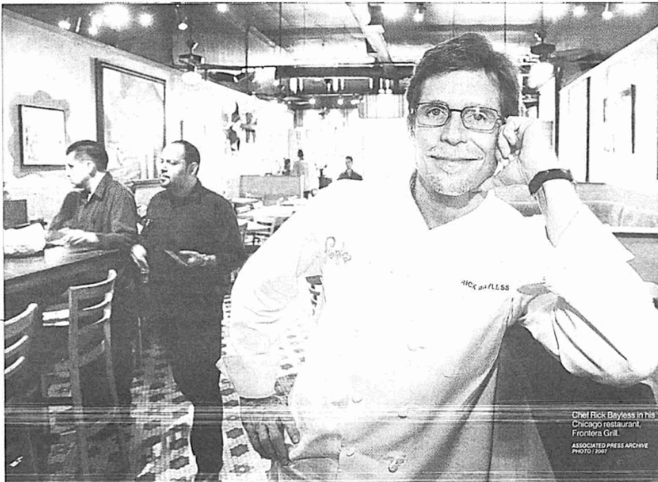
Chef Rick Bayless in his Chicago restaurant, Frontera Grill.