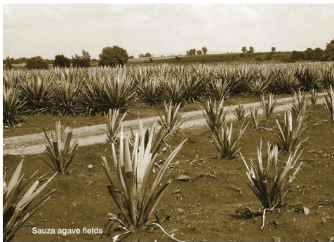
Sauza agave fields

April 2010 New York, NY Circulation: 5,724 Monthly