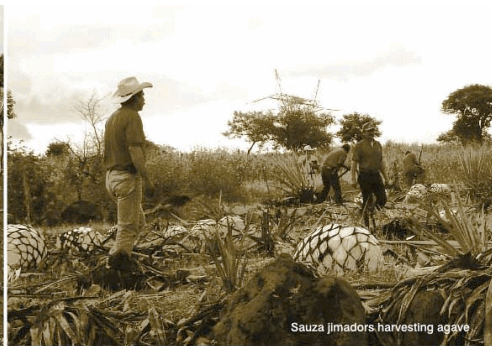
Sauza jimadors harvesting agave